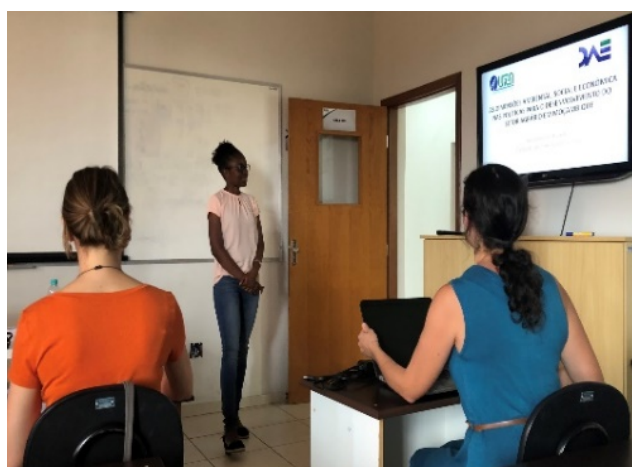
Figure 2 BHEARD scholar from Mozambique during her thesis defense.